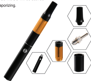
The Structure Of iGo-MBCC

iGo-MBCC consists of power supply, clearomizer and mouthpiece. After entirely assembled, when you press the manual switch, the iGo-MBCC will be activated to vaporizing.