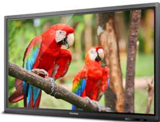
Full HD Resolution

For more product information, visit us at www.viewsoniceurope.com