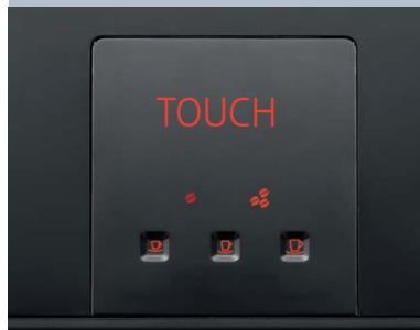
Extremely simple operation

The automatic energy-saving mode, programmed switch-off time and patented Zero-Energy Switch ensure high energy efficiency.