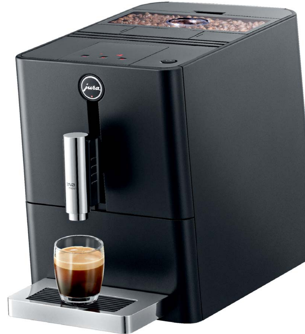
13594 ENA micro 1