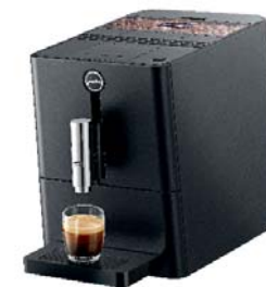
Also available as 13738 ENA micro easy