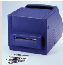
> Cutter mode