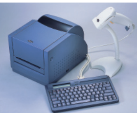
> Standalone mode with Argokee

The R-600 inherits the Refine Series' mechanism. Loading capacity accommodates a maximum 360M ribbon roll and 6" OD media supply. Adjustable media guide with centralized alignment fits all variable media from 25.4mm to 118mm. Easy access via a three-button control panel saves time and requires minimal training allowing the benefits of easy and fast handling. Built-in universal switch power offers 100% flexibility to fit in any local application environment, and it is lightweight, space-saving, and easy to handle. The R-600 maintains high quality printing with 300dpi resolution making it the value-added printer of choice for textile and care labeling applications.