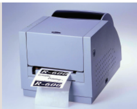
> Dispenser mode