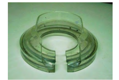
Figure 2: Cover for the Hobart pulper