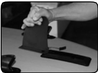
1. Slide fin base into fin box