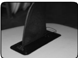
4. Correct fin installation