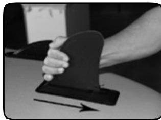
2. Slide fin all the way to back of the fin box