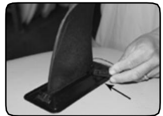
3. Insert fin retention pin through slot