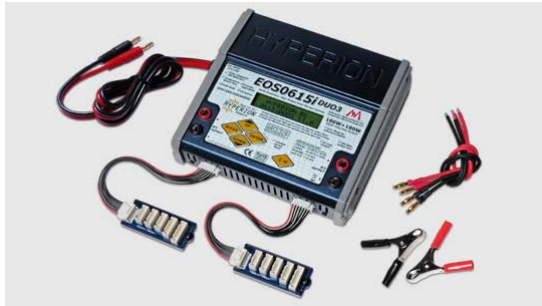
USB Cable also included but not pictured

v3.2 Firmware version. Visit http://media.hyperion.hk/dn/eos for the newest manuals, firmware, and software