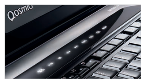
The newly redesigned Multimedia Bar features white LED feather-touch Easy Keys for ultimate ease of use. The LED-illuminated TouchPad includes an integrated Fingerprint Reader.