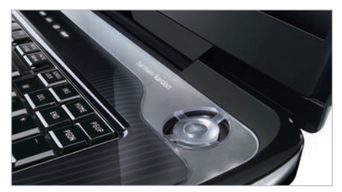
Illuminated Harman Kardon® stereo speakers with subwoofer and Dolby® Sound Room™ generate compelling soundscapes for movies, music, games and broadcast TV.