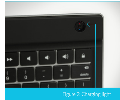
Figure 2: Charging light