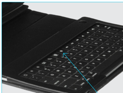
Figure 6: Shortcut Keys

The shortcut keys are shortcuts to various functions on your iPad. They are located in the top row, directly above the number keys. (Figure 6)