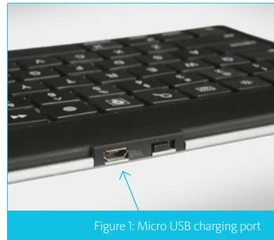
Figure 1: Micro USB charging port