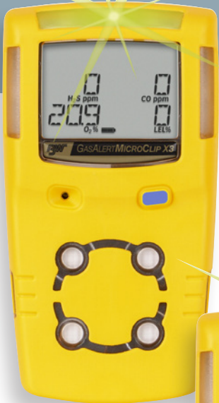
GasAlert MicroClip X3

Guaranteed to run for an entire shift — even in harsh weather.