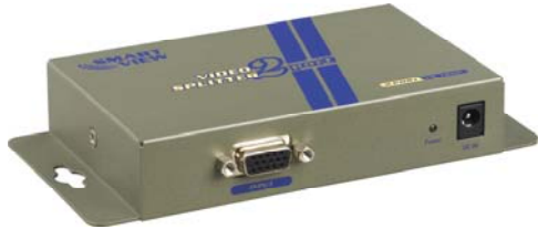
(VS-12HF) 1 In 2 Out