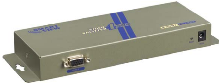
(VS-14HF) 1 In 4 Out