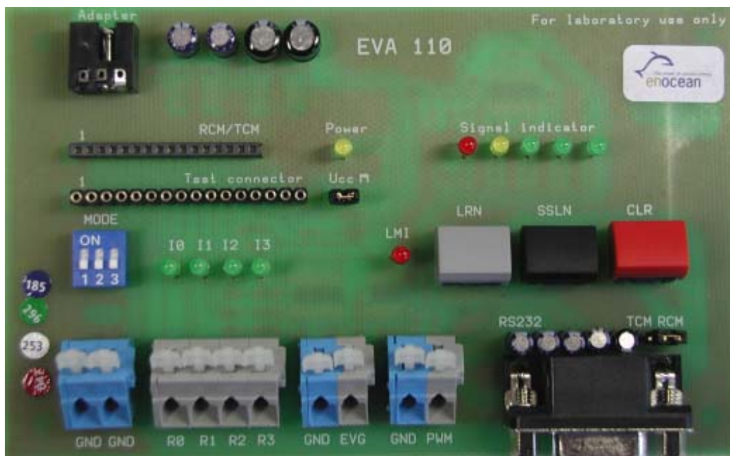
Figure: On-board connectors, switches and indicators