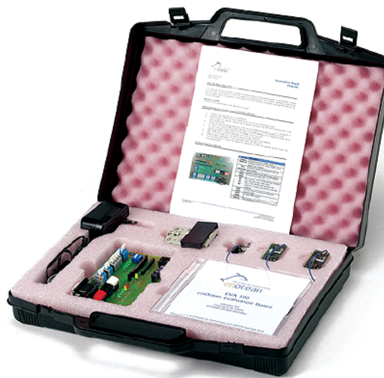
Figure: EVA EnOcean Evaluation Kit

EVA 100 and EVA 105 are evaluation kits to support the development of applications based on the EnOcean RCM receiver modules and the TCM transceiver modules. The kits support a quickly evaluation of all RCM receiver operation modes as well as a quite easy setting-up operation of the receiver side when EnOcean transmitter modules are evaluated.