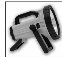
Patented Swivel Stand for Ultimate Flexibility