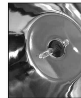
High Intensity Discharge Light