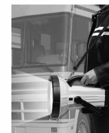
Nylon Carrying Strap Included