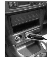
DC Charging with CLA Adapter - Use in Car, Boat, Truck or Job Site

Never leave battery discharged, recharge battery immediately after discharging. Recharge battery every 3 months even when the unit is not used.