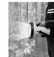
Carrying Spotlight or Patrolling Searchlight