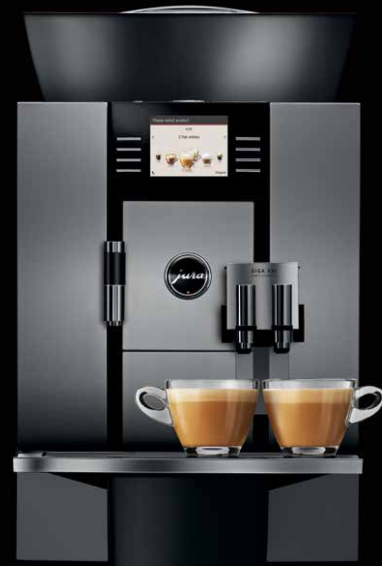
GIGA X3c Professional

With a wide selection of accessories including a cup warmer, milk cooler, coffee grounds disposal function set and interface for accounting systems, as well as an attractive range of storage and presentation units, it is possible to create a complete coffee solution tailored to your specific requirements.