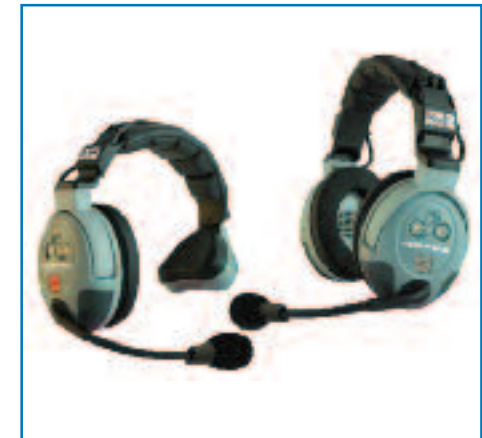
Duplex Wireless System