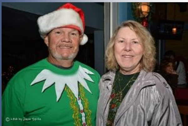
Pura Vida Divers Christmas Party