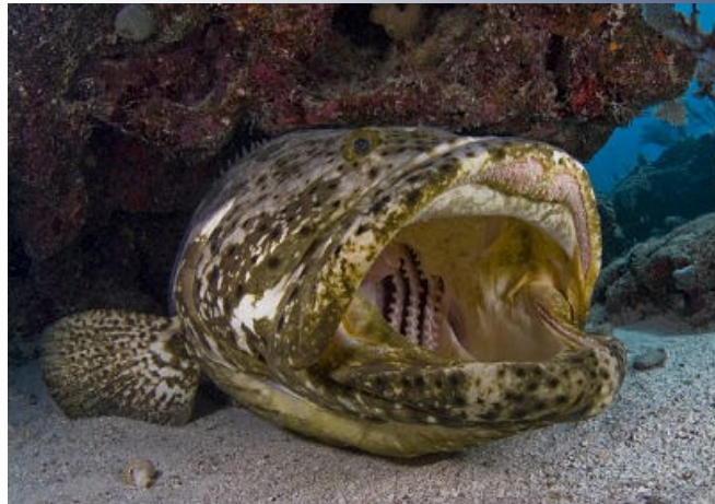
2nd Place — Shen Collazo