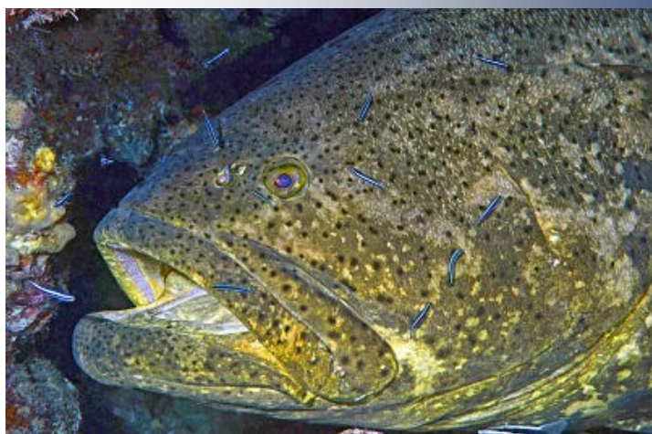
5th Place — Judy Townsend