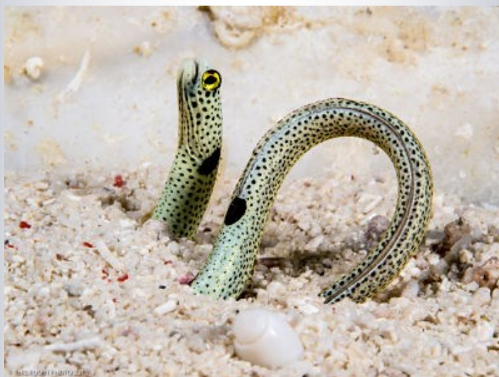
Garden eel, Heterocanger Hassi, Panglao Island Bohol Philippines