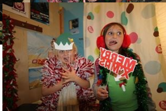
Force-E Divers Christmas Party