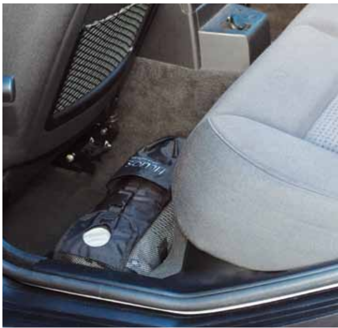
Transportation of a Marathon portable liquid flask.

Even if you have a condition which requires oxygen therapy, you may wish to go on holiday either within the UK or abroad. We have put together some key considerations for you if you wish to go on holiday. We can help with many of the details and offer advice. Please give us at least 3 working day's notice of your holiday requirements, however it is best to request as early as possible.