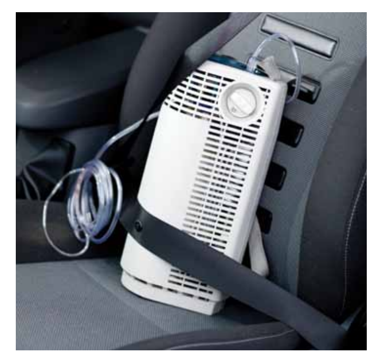
Transportation of a Companion portable liquid flask.