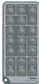
Infrared Remote Controller

Users must use the Infrared Remote Controller to operate iDMX7. All working modes and relevant parameters can be set by operating the Infrared Remote Controller.