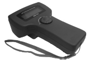
XB-R1 (Sold separately)

iDMX7 can record DMX as a maximum speed of 25 frames per second (512 channel). The excess of the maximum speed will result in the loss of DMX frame. Normally, the time of DMX recording is 400 seconds, the minimum DMX recording time is 200 seconds.