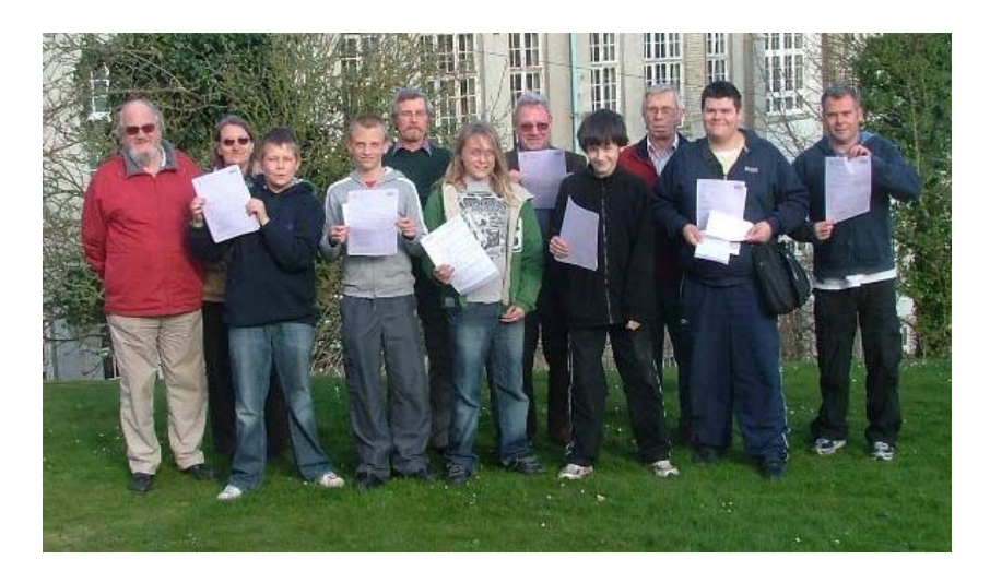
Some of the Foundation course students and instructors 28<sup>th</sup> March

Eight students attended the course run on 21<sup>st</sup> and 28<sup>th</sup> March. I am pleased to report that six of them were successful in the examination with two more failing by the very narrowest of margins. We have now had 161 successful candidates and we have just maintained our success rate of 92%.