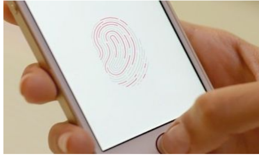
Touch ID is ready for an upgrade.

Touch ID has completely changed security on the iPhone, and now Apple's fingerprint-scanning technology could soon be coming to the Mac.