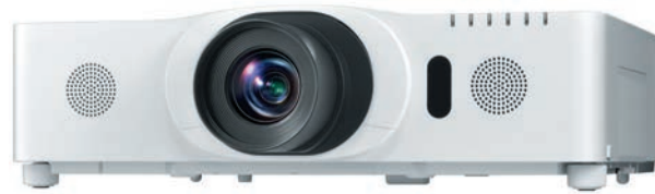
Front 3/4 View

your specific application, and is wireless presentation ready. Plus, embedded networking gives you the ability to manage and control multiple projectors over your LAN (scheduling of events, centralized reporting, image transfer, and e-mail alerts). Even with the array of advanced features, Hitachi's CP-WU8440 is designed for user-friendly operation and installation convenience.