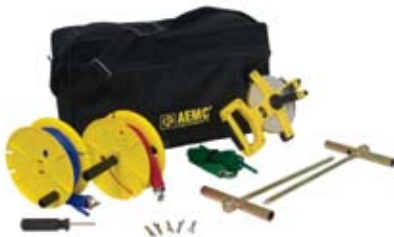
Test Kit for 3-Point testing includes two 150 ft color-coded leads on spools (red and blue), one 30 ft lead (green), two 14.5" T-shaped auxiliary ground electrodes, one set of five spaded lugs, 100 ft tape measurer and carrying bag. Catalog #2135.35