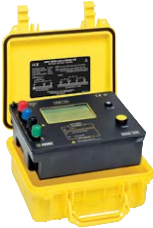
The Models 4620 and 4630 are built into a double case. This extra rugged construction provides double insulation, maximum field durability and ease of serviceability.