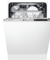
ESL6610RO RealLife XXL TimeSaver