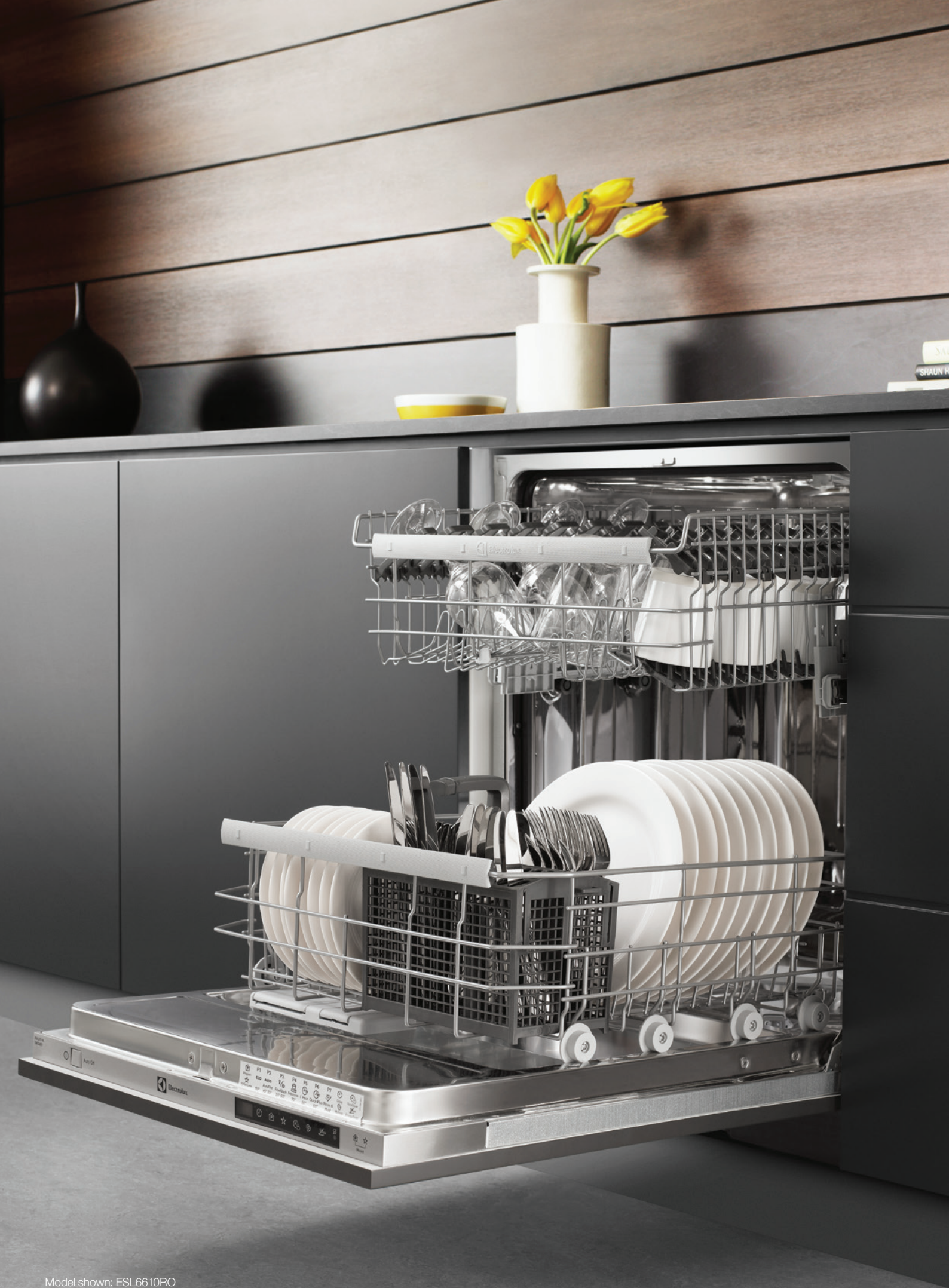
Model shown: ESL6610RO