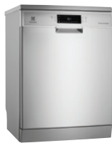
ESF6700ROX RealLife XXL TimeSaver