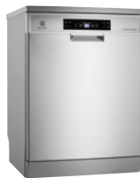
ESF6800ROX RealLife XXL TimeSaver