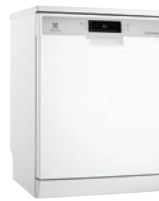
ESF6700ROW RealLife XXL TimeSaver