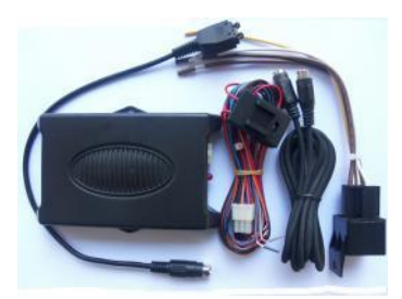
Dynapage Cellular pager