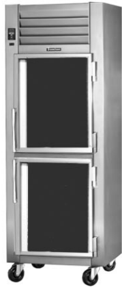
Model RHT126WPUT-HHG (shown with optional fluorescent lights & casters)