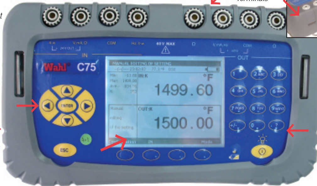
Wide backlit Screen