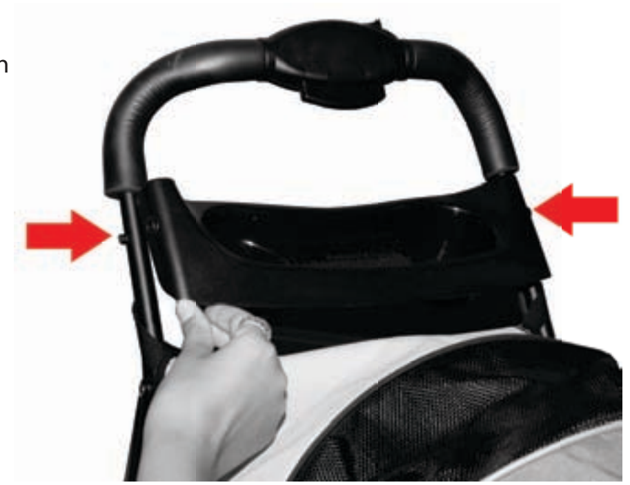
Arrows indicate location of bolts on stroller.

Step 2. Snap one side of the tray over the bolt on the handle then repeat for the other side.