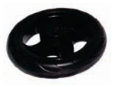
REAR WHEELS (2)