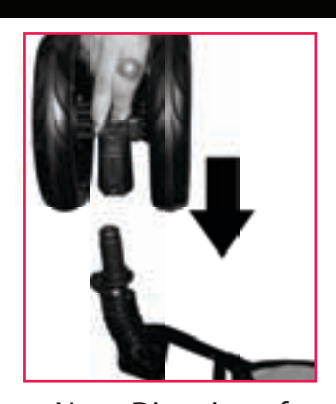
Note: Direction of Arrow