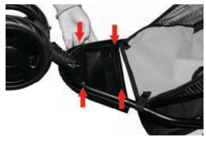
Arrows indicate location of holes.