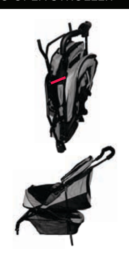
Step 2. Unfold as shown Make sure both locks snap into place.