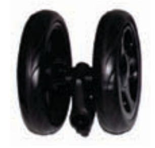
FRONT WHEEL ASSEMBLY (2)