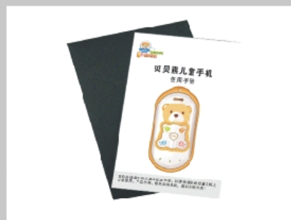
User manual (standard)

Please check whether these accessories are included.