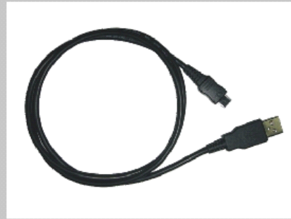
USB cables (standard)