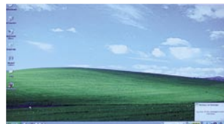
VGA Signal |