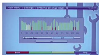
DVB-T Settings |