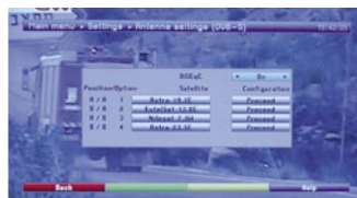
DVB-S Settings |