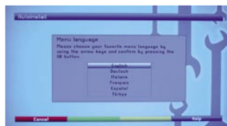
Installation Assistant |

Existing channel names could not be changed. The channel switching speed as well as the preprogrammed satellite list could use some improvement.