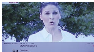
Info Bar |