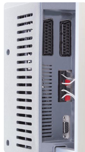
Connections for audio and video accessories on the underside

The HD-Vision supports both HDTV 720p and HDTV 1080p and therefore justifiably carries the HDTV Ready logo. The HD-Vision comes with an automatic picture brightness control so that it can adjust itself to the conditions of any room and deliver an optimal picture. We also successfully tested the connection of a YUV and RGB capable PVR receiver. The HD-Vision is also capable of turning itself on automati-