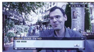
HDTV Signal |