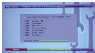
Channel Scan |