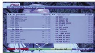
Channel List Editing |