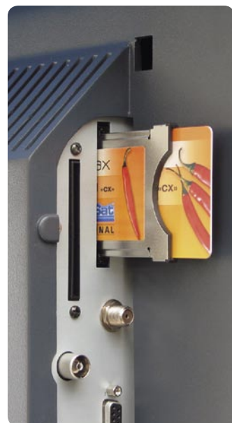
CI Module Slot

In our tests, roughly 20 minutes was needed to scan three satellites as well as the analog and digital terrestrial bands. And we weren't disappointed either: the HD-Vision 32 managed to find every channel. Even the weaker signals from the multiple cameras we use to keep an eye on the entrance hallway and also the satellite dishes on the roof were recognized without any difficulties.