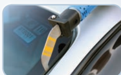
Blades for all applications