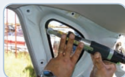
Access confined spaces