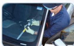
Reach below dashboards

See Page 6 for Auto Glass Removal Applications