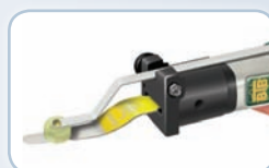
Cutting depth control