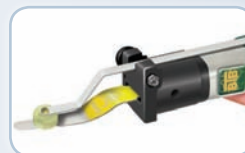
Precise depth control