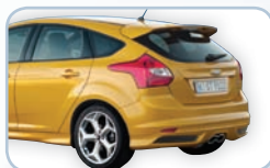
Curved and Hatch Glass

See Pages 6 & 7 for Glass & Body Panel Removal Applications