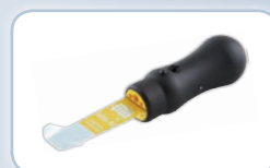
Pinchweld trimming blades