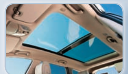
Panoramic roof systems