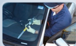
Reach below dashboards

All BTB blades are designed for use in the BTB E-TOOL , Air Tool and Manual Handles.