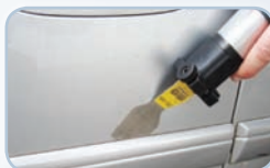
Body moulds & badges