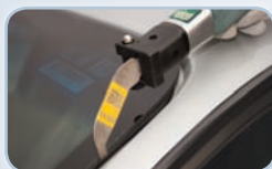
Blades for all applications