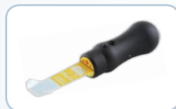
Pinch weld trimming blades

See Pages 6 & 7 for Glass & Body Panel Removal Applications