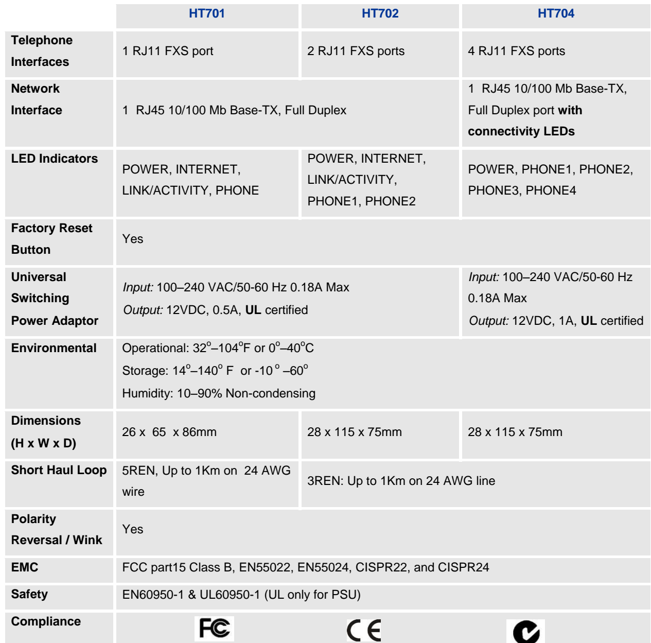
TABLE 5: HT70X HARDWARE AND TECHNICAL SPECIFICATIONS

The table below lists the Hardware and Technical specification of HT70X.