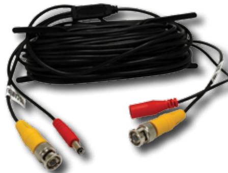
BNC Video & DC Power Cable