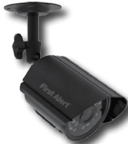
Camera - Ceiling Mounted