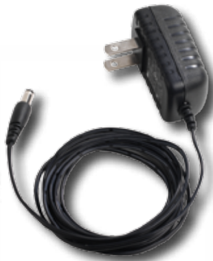
12V DC Power Adaptor