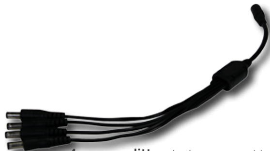
4-way splitter (only comes with CM6004PC)