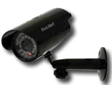
Camera - Wall Mounted

Select the position for the camera and secure the camera stand. Screw the camera onto the stand. Adjust camera to the proper view angle. Make sure the lens is upright relative to the subject. Tighten the thumb bolt. First Alert cameras can be either ceiling or wall mounted by simply reversing the camera stand mounting. See "Camera Orientation" Info box. Run cable from camera to DVR location. See Information box below on "Longer Cable Runs".