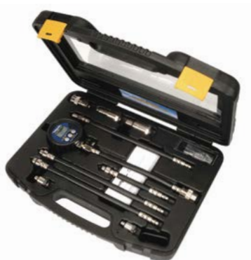
Digital Compression Test Kit