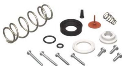
Silverline Maintenance Kit