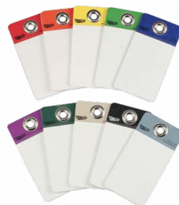
Trico Spectrum Tag