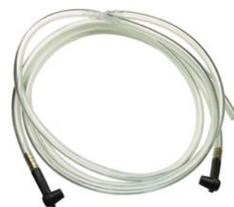
Dual Adaptor Bleed Kit