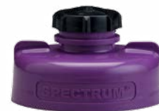
Pump Storage Lid