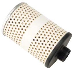
GPI FM-100 Series Filter Element