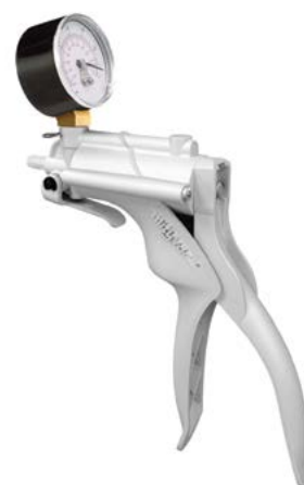
Selectline Superpump with Gauge