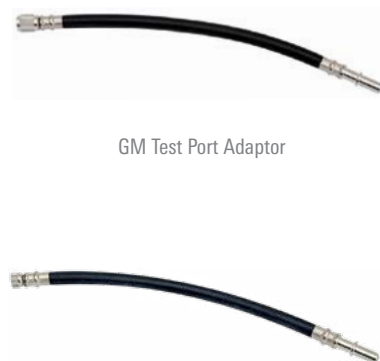
GM Test Port Adaptor