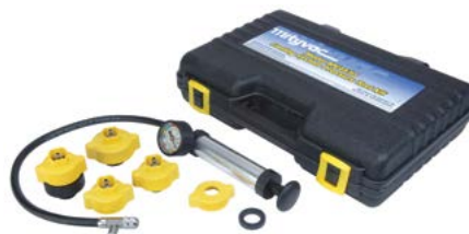
Cooling System Pressure Test Kit