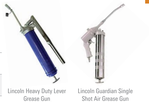
Lincoln Heavy Duty Lever Grease Gun