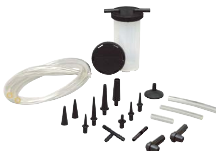
Automotive Test and Bleed Kit