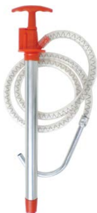
20L Hand Oil Pump