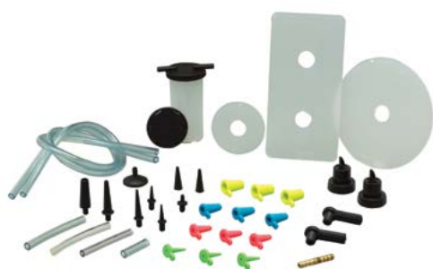
Complete Auto Accessory Kit