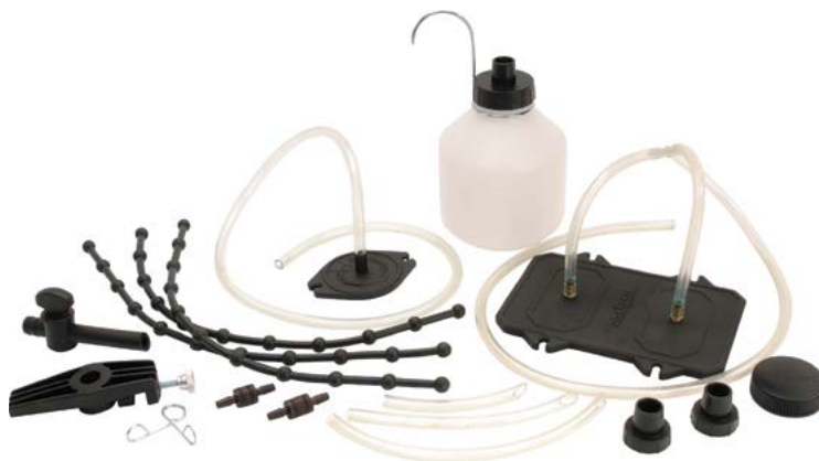
Master Auto-Refill Kit