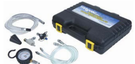
Cooling System Air Evacuation Kit