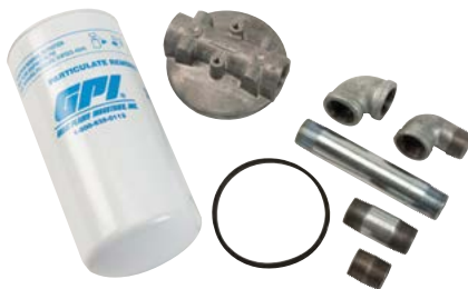
GPI Fuel Filter Kit – 52-133537-01