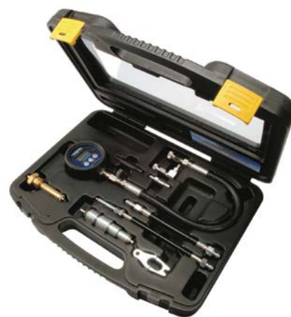
Digital Diesel Compression Test Kit