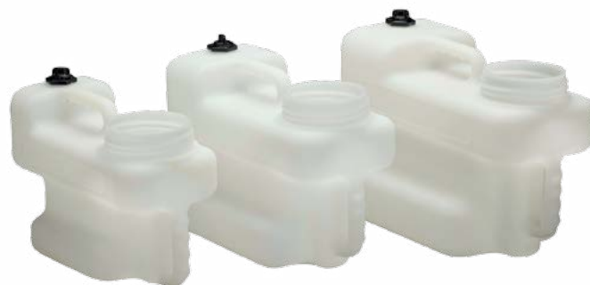
Trico Oil Containers