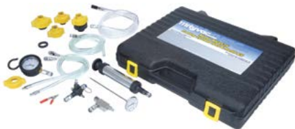
Cooling System Test and Refill Kit