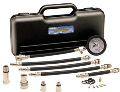
Pro Compression Test Kit