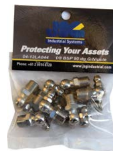
Grease Nipples - Pack of 10