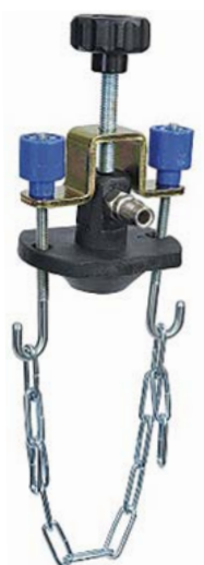
Pressure Bleed System – 12-MVA809