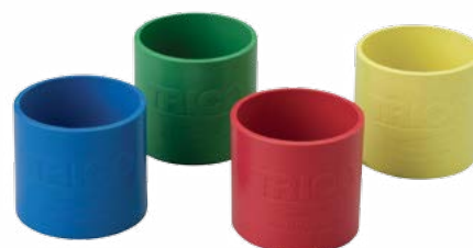
Trico Grease Gun Bands