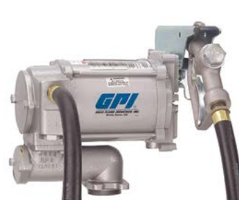
M3260 shown with Manual Nozzle

Note: *Electric pumps suitable for diesel and Kerosene. U.L approval only for pumping Gasoline in U.S.A.