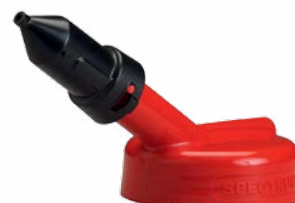
¼" Nozzle Lid