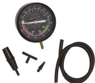
Vacuum Pressure Test Gauge and Fuel Pump Tester