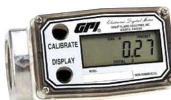
03 Series High Accuracy Electronic Meter