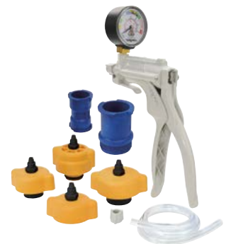
Cooling System Pressure Test Kit