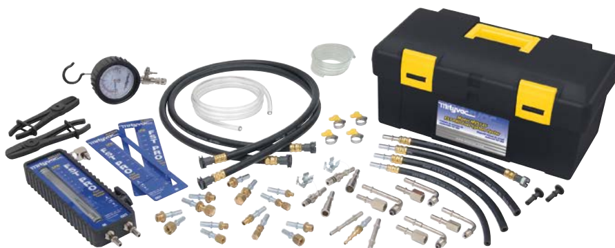
Fuel System Test Kit