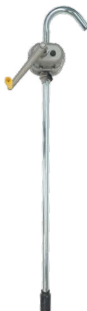
High Volume Rotary Pump