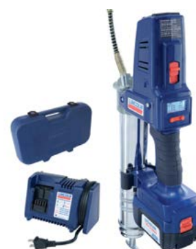
Lincoln Guardian Li-ion 18 VDC Grease Gun