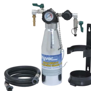
Fuel Injection Cleaning Kit