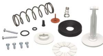
Superpump Maintenance Kit