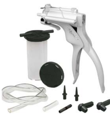
Selectline Automotive Brake Bleed Kit