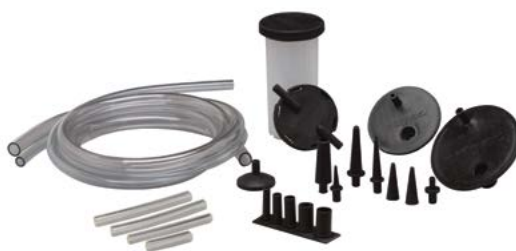
Fluid Transfer Kit