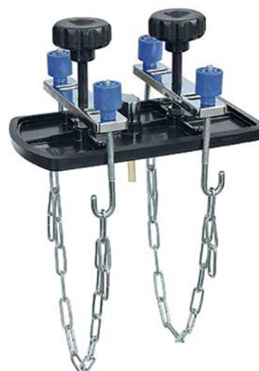
Pressure Bleed System – 12-MVA812