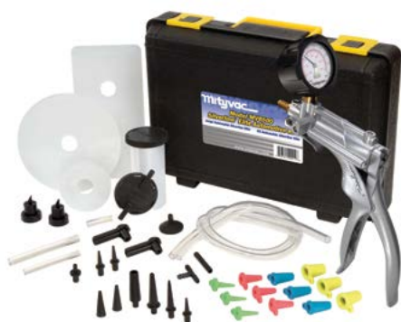
Silverline Elite Hand Pump Kit