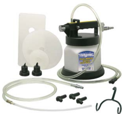
Airbrake Bleeder and Evacuator