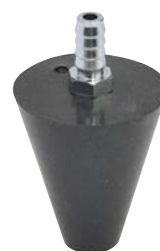
Power Steering Adaptor