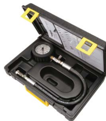
Analog Compression Test Kit