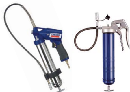
Lincoln Air Operated Grease Gun