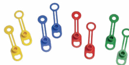
Trico Grease Fitting Caps