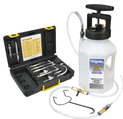
ATF Refill System