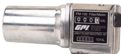
FM-100 Series Mechanical Meter with Filter