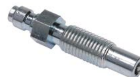
Glow Plug Adaptor