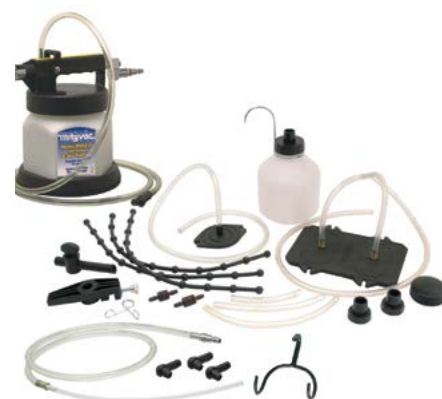
Master Vacuum Bleed Kit