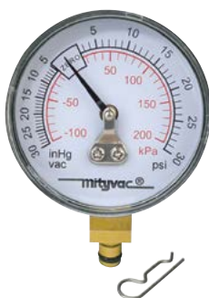
Vacuum Gauge Kit