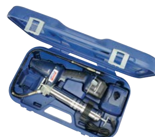
Lincoln Guardian 18 VDC Grease Gun