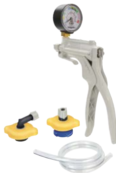
Motorcycle Cooling Test Kit