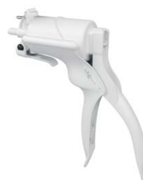
Selectline Superpump without Gauge