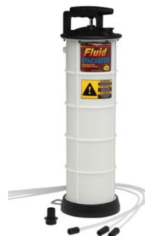
7.3L Fluid Evacuator