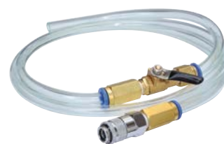
Transmission Refill Kit