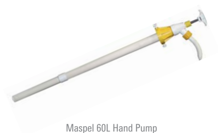
Maspel 60L Hand Pump