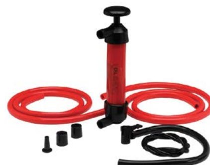
Fluid Transfer Pump