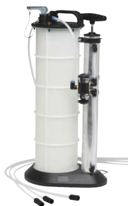
ATF Refill System