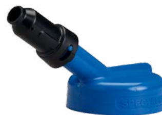
1" Nozzle Lid