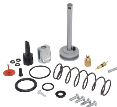
MV8510 Pump Rebuild Kit