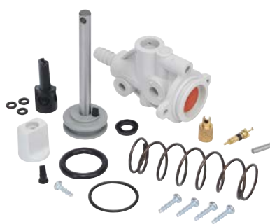
MV8255 Maintenance Kit