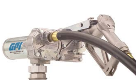
M150S shown with Manual Nozzle

Note: For other specifications refer to JSG sales personnel.