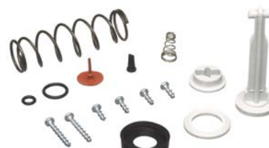
Pump Maintenance Kit