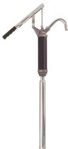
Lever Barrel Pump