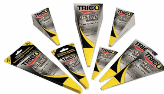
Industrial Fast Funnel

Trico's Industrial Fast Funnels® are the simple, convenient and clean way to pour fluids into containers and equipment. Intended for one-time use, each funnel remains clean and compact until separated from the header and opened. Made of coated, heavy grade paper stock, they can be used with most lubricants and liquids and are designed to fit a wide variety of orifices as small as 3/4" in diameter.