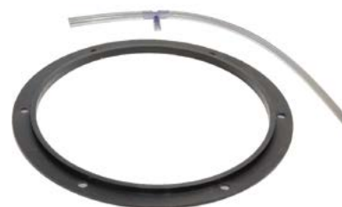
MV7201 Retrofit Kit