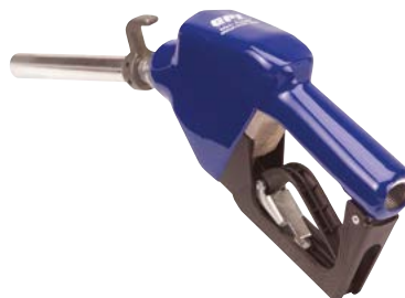
52-110121-8 Automatic Diesel Nozzle