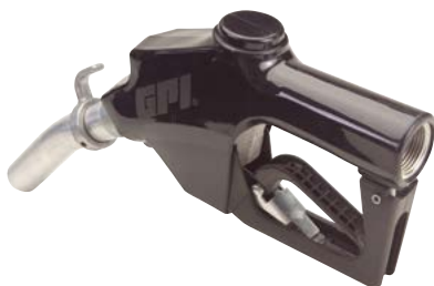
52-110376-01 Automatic Diesel Nozzle