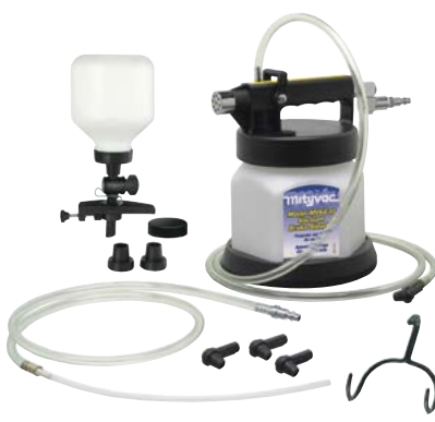
Premium Vacuum Brake Bleed Kit