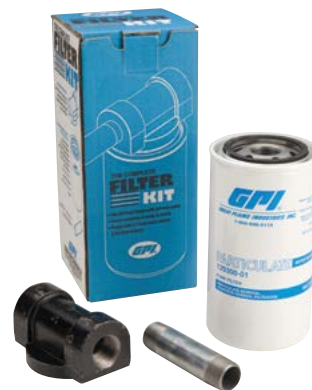
GPI Fuel Filter Kit – 52-133527-01