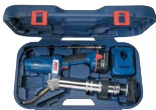
Lincoln Guardian 14.4 VDC Grease Gun