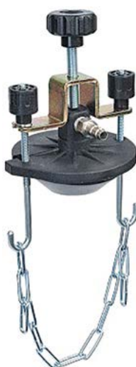
Pressure Bleed System – 12-MVA810