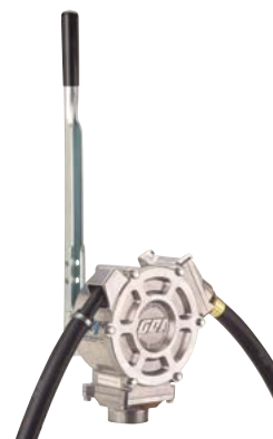
GPI 205L – 60L High Flow Hand Pump