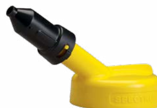
½" Nozzle Lid