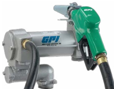
M3425 and M3025 shown with Auto Nozzle