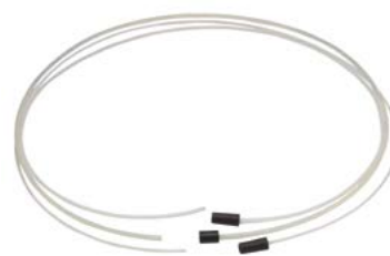
Extended Tube Kit