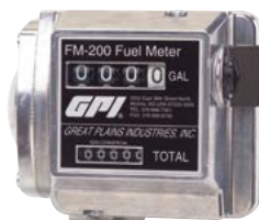
FM-200 Series Mechanical Meter