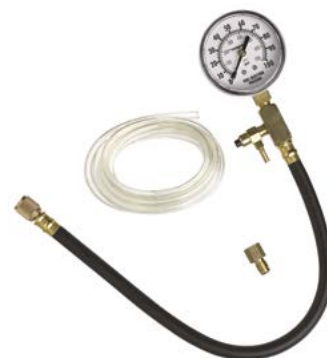
Fuel Injector Pressure Test Kit