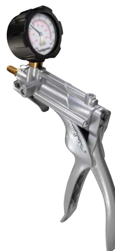
Silverline Elite Hand Pump