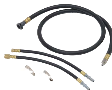
Pressure Test Accessory Kit