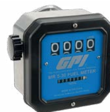
MR 5-30 Series Mechanical Meter for high flow