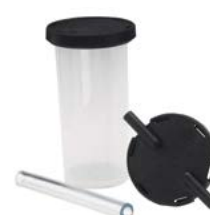
4oz Reservoir Kit