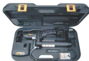
Lincoln Guardian 12 VDC Grease Gun