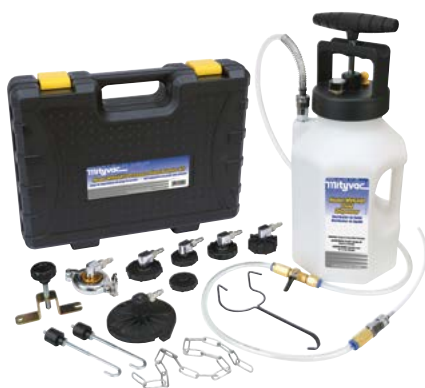
Pressure Bleed System