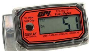
01 Series Economy Electronic meter