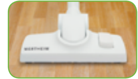
Cleaning on hard floors