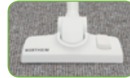
Cleaning on carpet

Ideal for daily cleaning on carpets and hard floors.