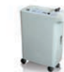
UltraFill station 1057100