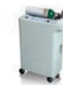
UltraFill system with 2 cylinders 1057101