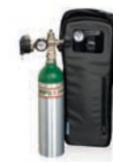
Medium cylinder bag 1065702