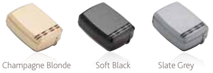
Baha 3 Sound Processor (BP100)