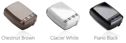
Baha 3 Power Sound Processor (BP110)