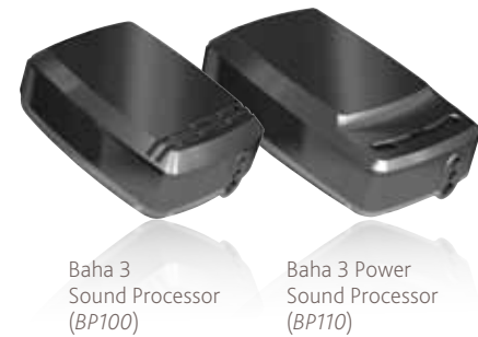
Baha 3 Sound Processor (BP100)