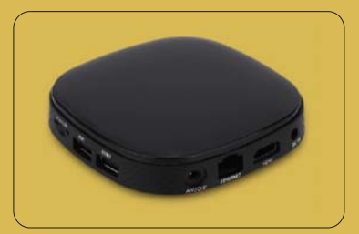
Smart TV Box

Here's what you should find inside the packing box: