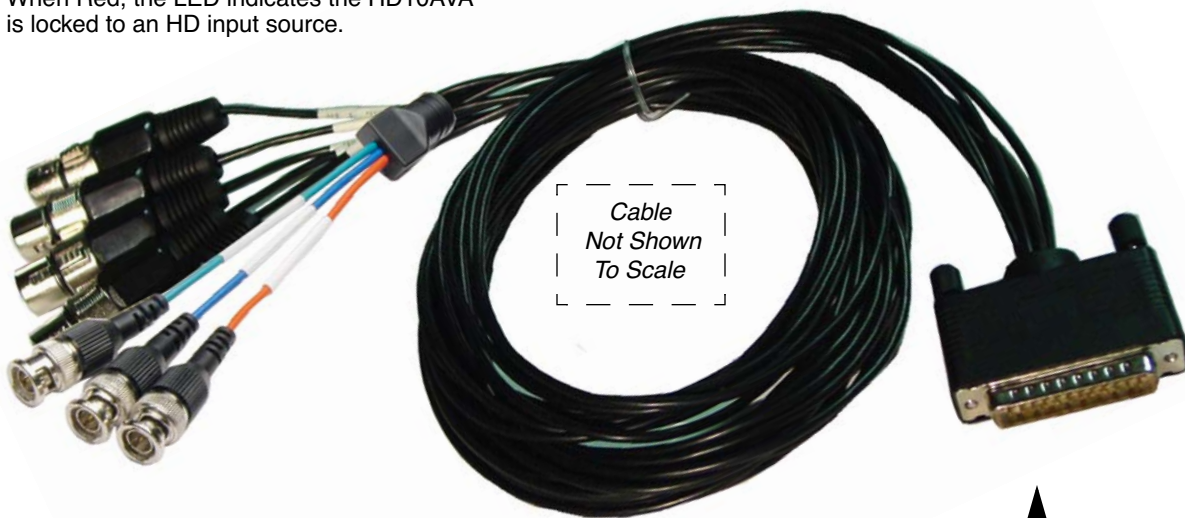
HD10AVA and Cable, Side View

LOCK LED: When Green, this LED indicates the HD10AVA is locked to an SD input source. When Red, the LED indicates the HD10AVA is locked to an HD input source.