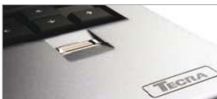
Fingerprint Reader: secure and convenient single touch sign-on