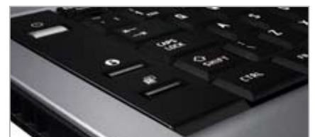
Toshiba Assist and Presentation Button: instantly launch tools and presentations

Toshiba EasyGuard Carefree Mobile Computing