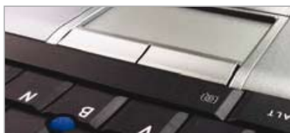
Toshiba Dual Pointing Device: featuring AccuPoint™ II and Touch Pad for optimum flexibility