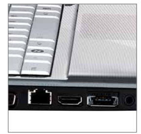
HDMI Port for superior digital connectivity

With its attention-grabbing Breeze Pattern and glossy Fusion Finish, the Satellite Pro L500 injects a welcome dash of style into everyday business computing. But because it's a Toshiba, what's inside is just as important as how it looks. This versatile machine is equipped with every essential to speed through all regular tasks, with outstanding multimedia capabilities on top. The 15.6" Toshiba TruBrite® widescreen delivers crystal-sharp HD visuals. It's supported by a range of powerful processing and graphics chips, plus high-capacity HDDs of up to 500 GB* with more than enough space for all your apps and data. Include the exciting array of Toshiba EasyGuard usability features and budget-friendly prices, and you're looking at a serious contender for today's top-value business all-rounder.