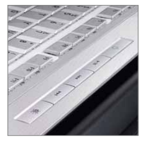
EasyControl Bar with 4 Control Buttons