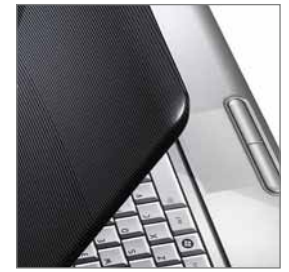
Steel Grey Fusion Finish with Breeze Pattern