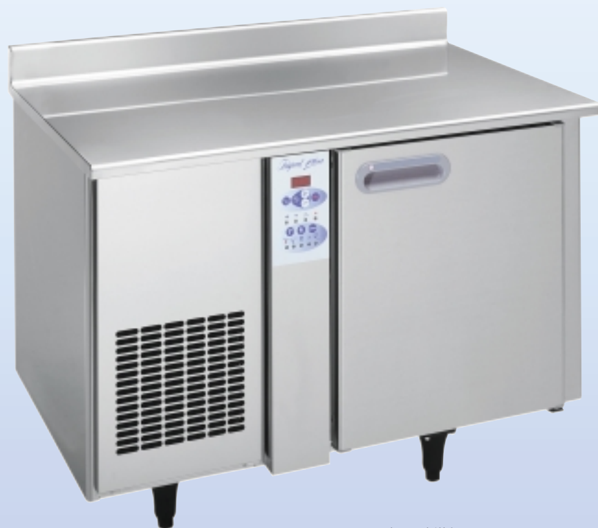
TSR-11SD Blast Chill/Freeze