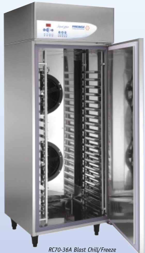
RC70-36A Blast Chill/Freeze