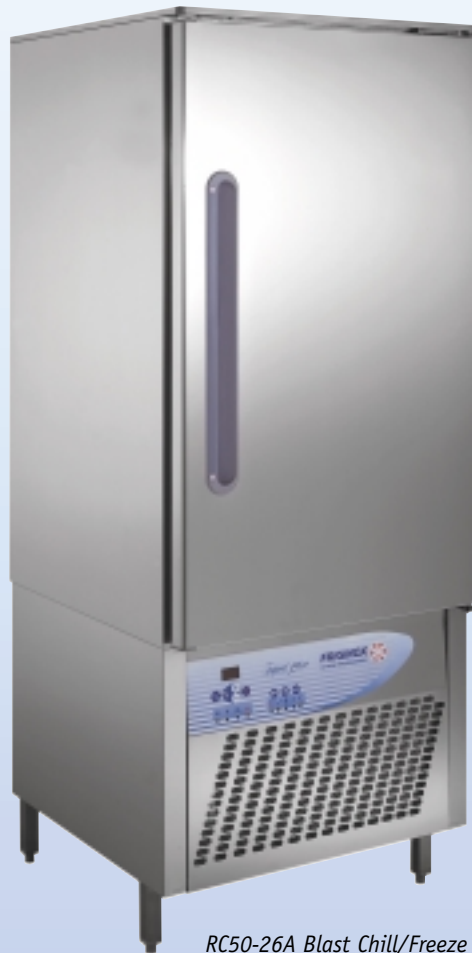
RC50-26A Blast Chill/Freeze