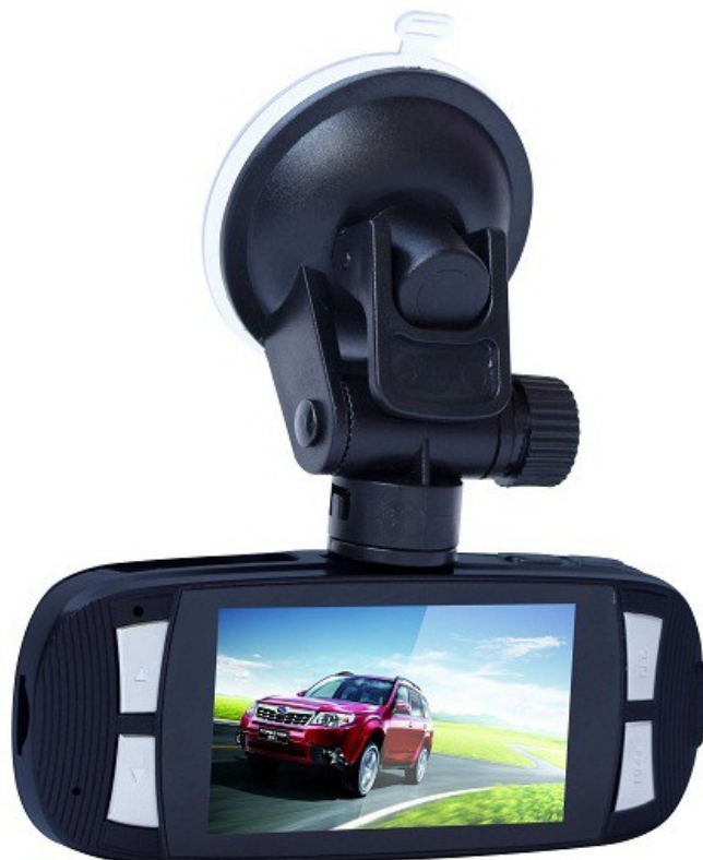
1. G1W-C with Mount

Now you may remove the clear film on the suction and attach to the glass surface. To remove the suction mount, pull the tag on the right-facing side of the suction and gently pull off the glass surface to detach.