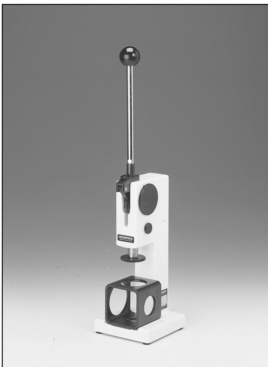
Fig.: APR 1