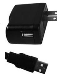
optional USB-type external power supply

ProKeys Sono can be used without a computer. This is referred to as standalone operation. An optional 9V, 500mA center-positive power supply (sold separately), or a USB-type power supply (also sold separately) is required for standalone operation.