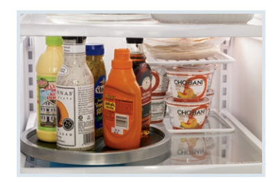
Most Usable Shelf Space<sup>1</sup> Our adjustable shelves have room to store more.