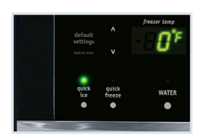
Quick Ice <sup>3</sup> Quick Ice delivers up to 37 percent more ice.

Our SpaceWise™ Organization system makes it easy to keep food organized and easy to find when you need it.