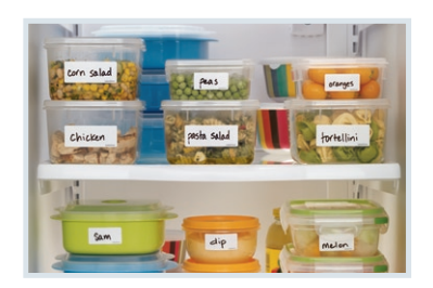
SpaceWise™ Organization System

Our SpaceWise™ Organization system makes it easy to keep food organized and easy to find when you need it.