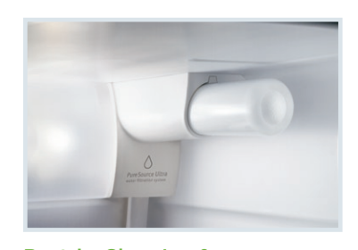
Best-in-Class Ice & Water Filtration<sup>2</sup> PureSource Ultra™ Water Filtration offers best-in-class water filtration so you get cleaner, better-tasting water at your fingertips.