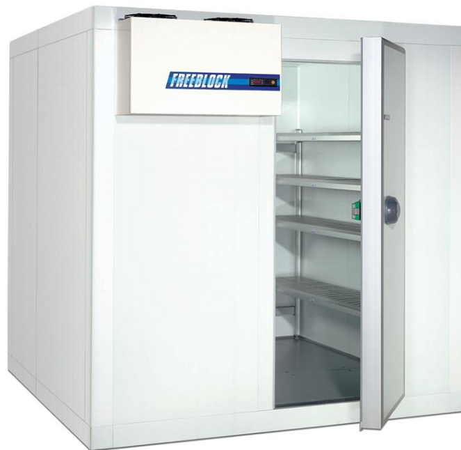
Shelving as accessory

Electrolux cold rooms are available in a vast range of different sizes and functionalities. They are designed to work in tropical temperatures (+43°C). The range consists of coolers (-2/+8°C) with panels 60 mm in thickness, freezer cold rooms (-10/-21°C) with panels 100 mm in thickness and with built-in or remote refrigerating unit. The three models detailed on this sheet are split unit freezers cold rooms with usable volume of 6,7 to 8 cubic meters. Models come with panels, gas pre-charged cooling unit and piping.