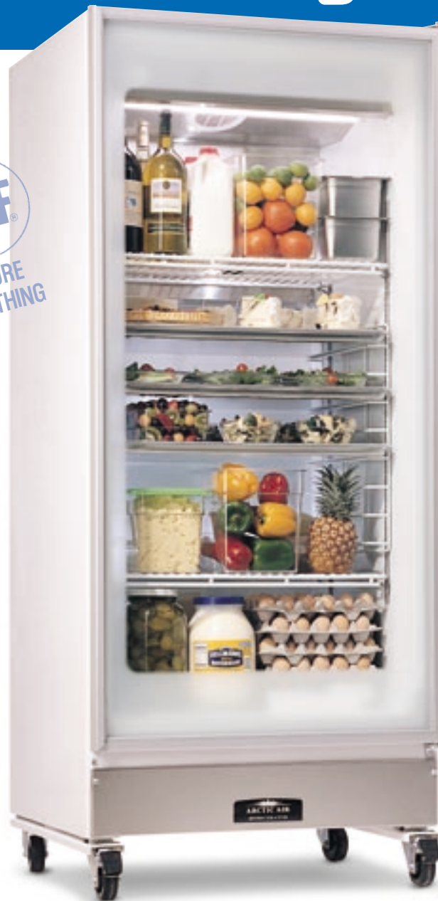
Refrigerator Model GDR22CWR (Shown with optional pan slide kit.)

Store anything ANSI/NSF Standard 7 certification. Approved for storing open food containers. A great value usually at $700-1000 less than competitive brands.