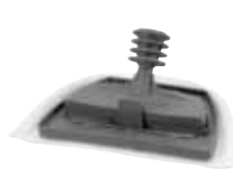
Flat surface microfiber cleaning tool