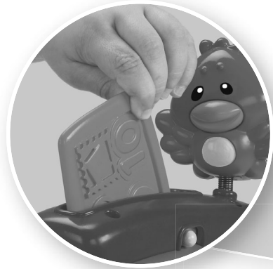
Drop letters into the slot