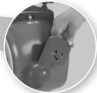
Lift and lower the flag