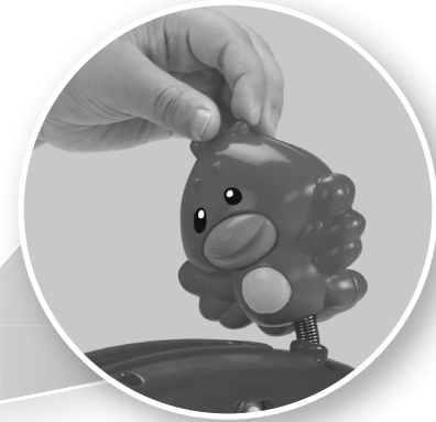
Bat the bird