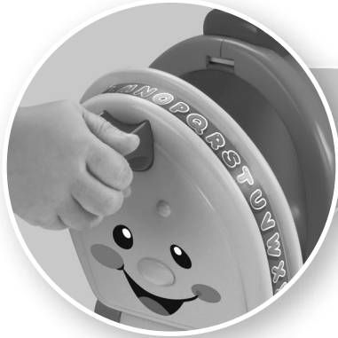
Open and close the postbox